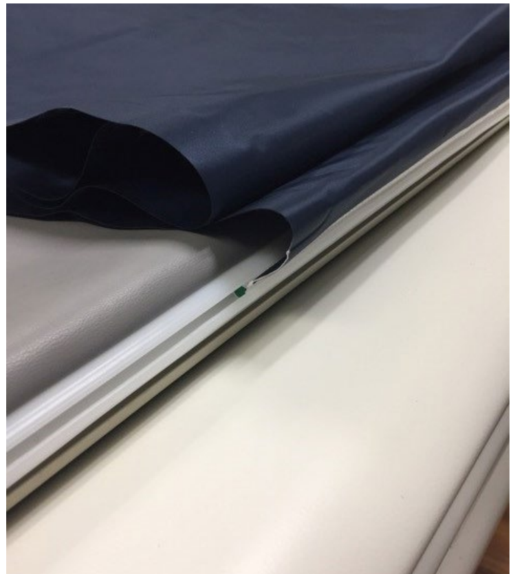
Scan-Bands® installed into the Scan-Track™ channel.