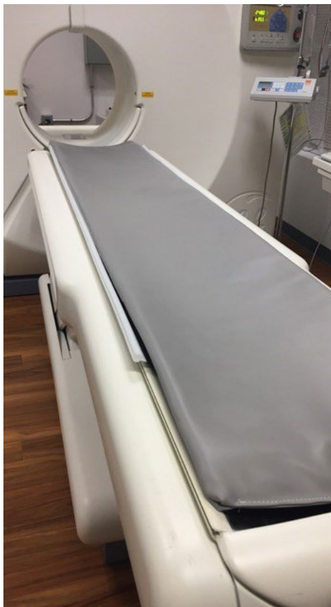
STEP 2 Table pad lays on top of channel