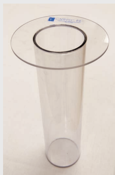
Chamber Well Insert