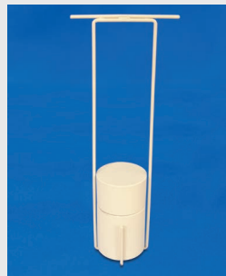
Molly Assay Canister