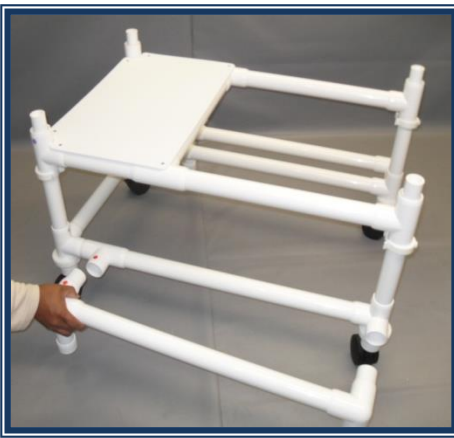
INSERT OUTRIGGERS ON THE SIDE OF THE BOTTOM FRAME BY MATCHING COLOR CODED DOTS AND SECURE USING SCREWS PROVIDED USING PILOT HOLES AS REFERENCE