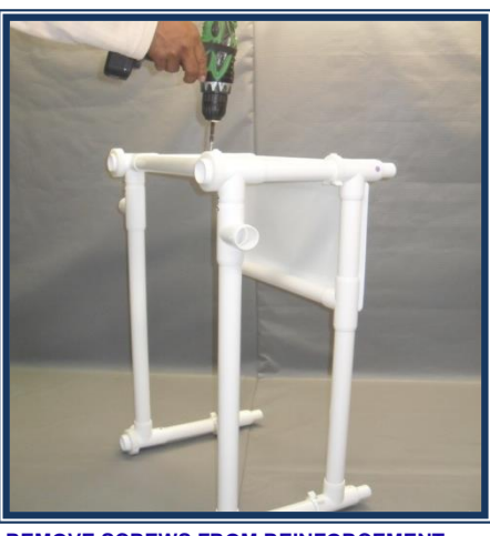
REMOVE SCREWS FROM REINFORCEMENT RINGS