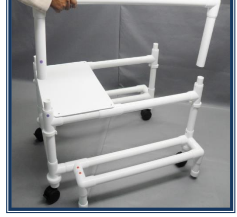
INSERT SIDE RAILS BY MATCHING COLOR CODED DOTS.

MJM International Corporation www.mjminternational.com