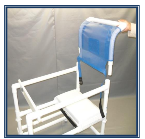
INSERT MESH SLING WITH PVC BACK TOWARDS SEAT SECTION ON TOP OF SIDE RAILS,SECURE USING SCREWS PROVIDED AND PILOT HOLES AS REFERENCE.