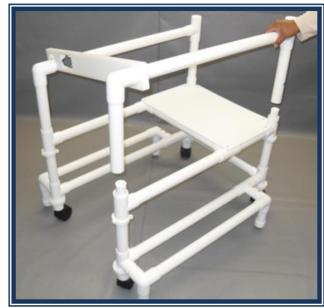
INSERT SIDE RAILS BY MATCHING COLOR CODED DOTS .