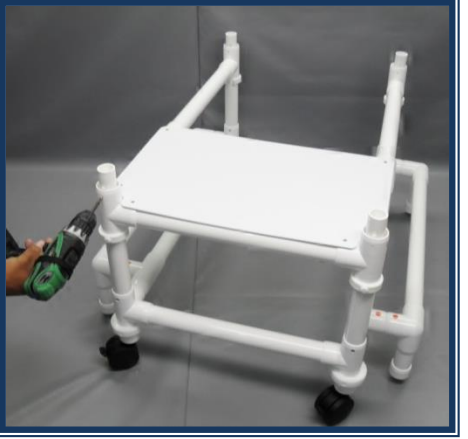
REMOVE SCREWS FROM AREA BY SEAT SECTION