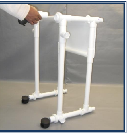
INSERT CASTERS --PLACE BRAKE WHEELS ON THE REAR OF THE WALKER