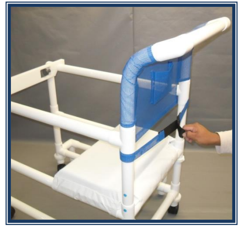
ADJUST MESH SLING AS NEEDED