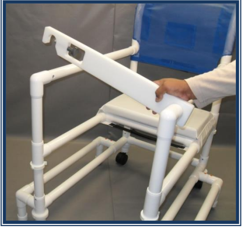
SECURE FLAT GATE ON FRONT SIDE RAIL USING PILOT HOLE PROVIDED