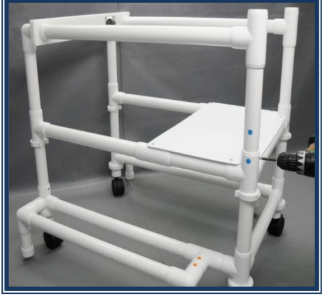
SECURE SIDE RAILS USING SCREWS PROVIDED AND PILOT HOLES AS REFERENCE