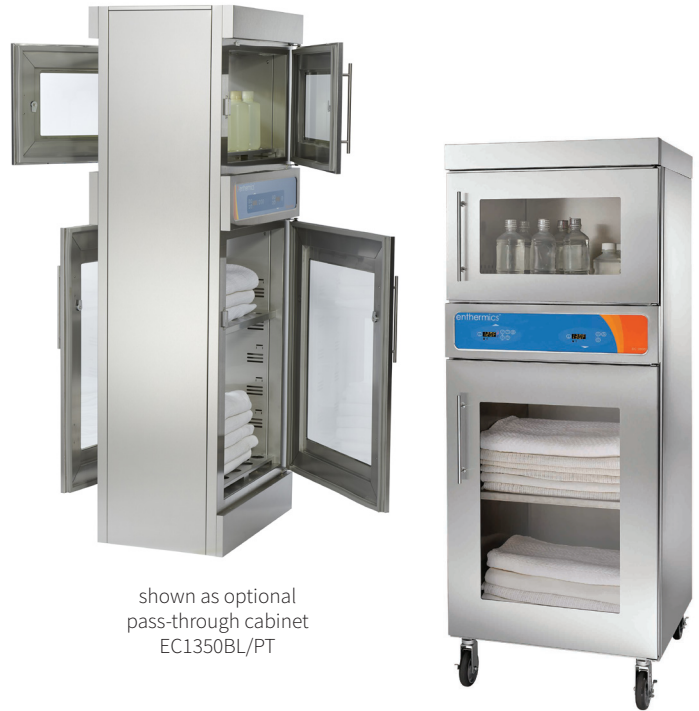
shown as optional pass-through cabinet EC1350BL/PT

30 EC1850BL 30 (1) liter bottles/24 (1) liter bags